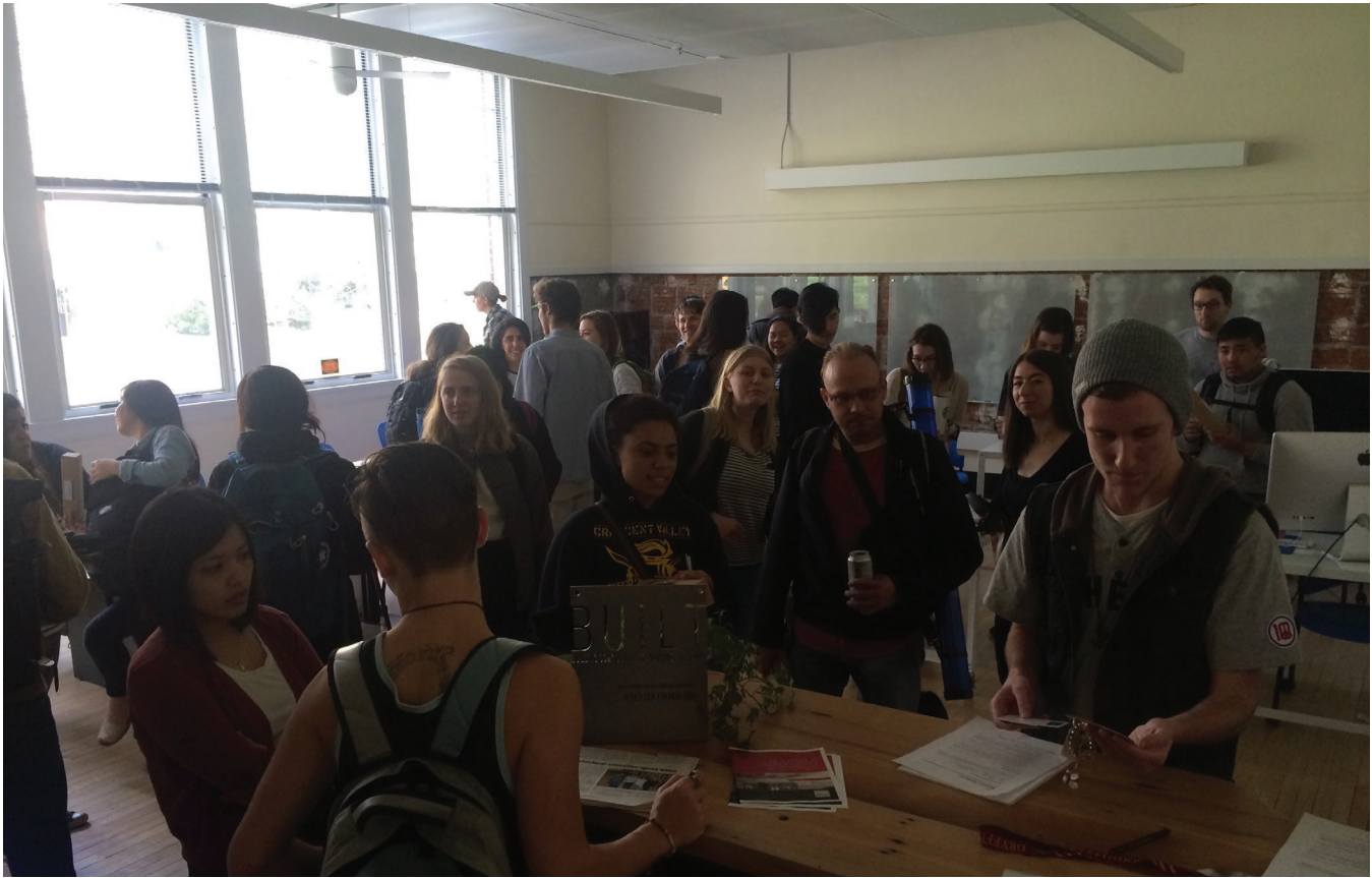
Figure 1. Students check out equipment from the tool lending library for their Measuring History project.

In Spring 2016, BUILT partnered with Associate Professor B.D. Wortham-Galvin to deploy an active learning component as an in-class exercise for an existing undergraduate history survey course. The active learning exercise proposed to have students collect building performance measurements on pre-modern, modern, postmodern and contemporary buildings in order to engender a greater discussion on the relationship between building performance, architectural form and cultural context. Sustainability competencies targeted for this exercise were strategic knowledge and collaboration. The strategic knowledge cluster was specifically focused on exposing students to an alternative perspective of the subject. In this case, students were exposed to and expected to look at historic buildings through the lens of building science by going out into the field to collect data and generate a comprehensive understanding of the assigned building. Building measurements, their analysis, and synthesis with the larger story were done collectively, thus satisfying a collaboration sustainability cluster.